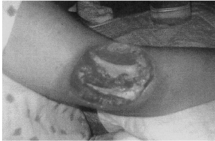
FIG. 1. Radiation burn resulting from debridement following radiofrequency cardiac catheter ablation procedure. Injuries of this magnitude are very rare. This case will be discussed fully in an article in the first edition of the Journal of the American College of Medical Physics in 2000.

cancer and severe injuries in a small but growing population of physicians and patients. More than fifty radiation burns, including a very recent one that produced a deep necrotic ulcer and ultimately rendered the humerus of a patient visible (Fig. 1), have been reported in the United States. A 1994 advisory notice issued by the U.S. Food and Drug Administration warned facilities of the potential dangers of invasive fluoroscopic procedures. The notice recommends that facilities “assure appropriate credentials and training of physicians performing fluoroscopy.”